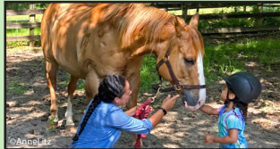
Horse Discovery Centers