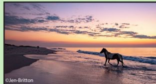
Wild Horses at the Ocean

Anywhere you travel in Maryland, you will find unique experiences with horses